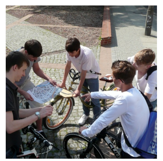
Youths with bicycles on HÖRPOL-tour

Although HÖRPOL was originally designed as a "city walk" through Berlin Mitte especially for young people, people's experiences assign other possible applications to HÖRPOL: